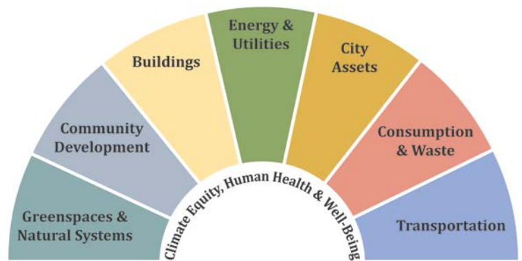
Climate Plan Focus Areas

The Climate Plan will identify strategies for climate mitigation and adaptation in areas with the greatest opportunities shown to the right. Climate equity and human health and well-being will serve as cross-cutting themes throughout the plan’s development.