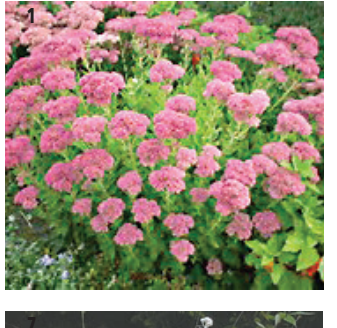
*indicates plants native to Montana.