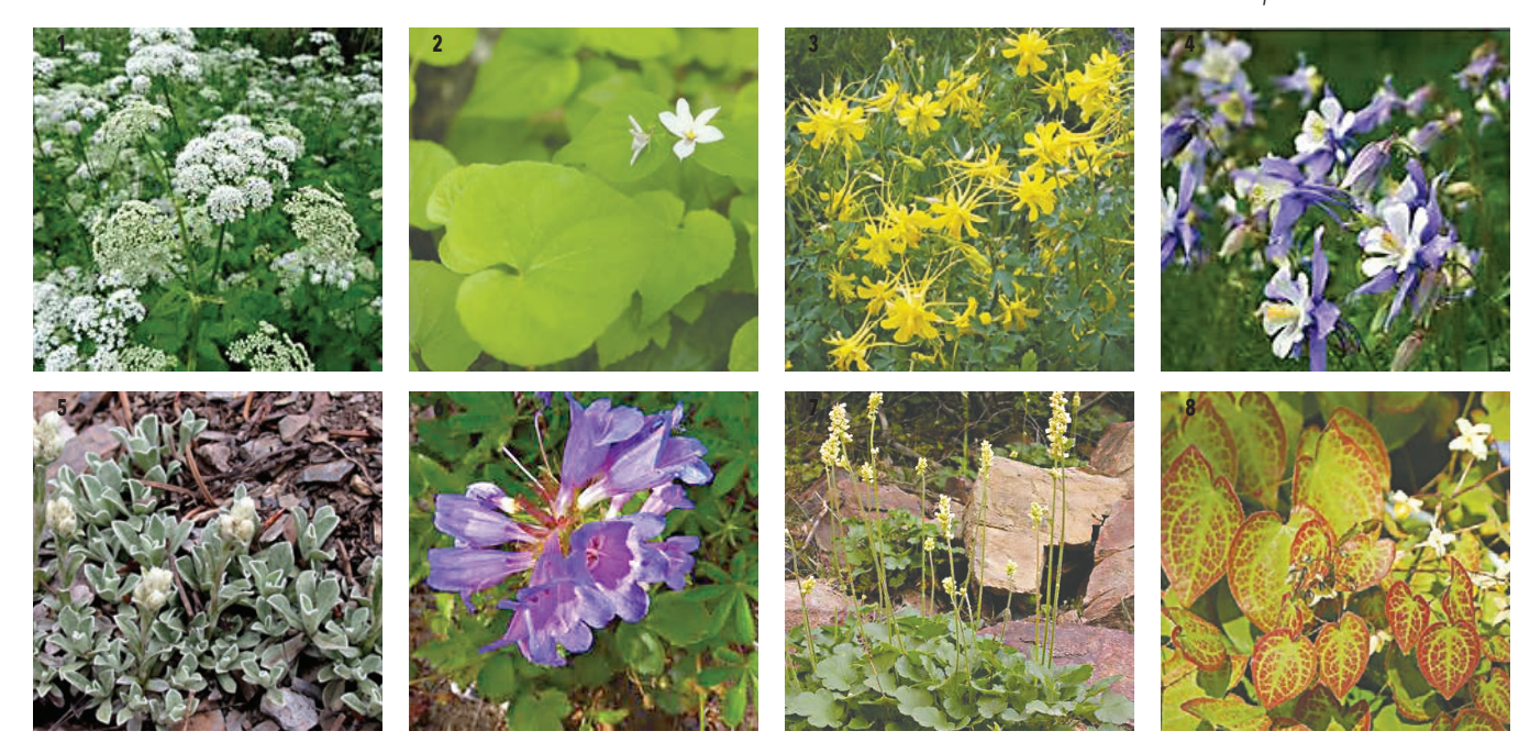
*indicates plants native to Montana.