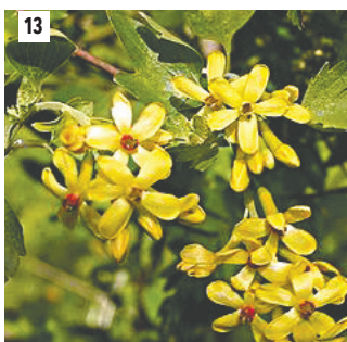
Drought Tolerant Shrubs for Full Sun (continued on p. 9)